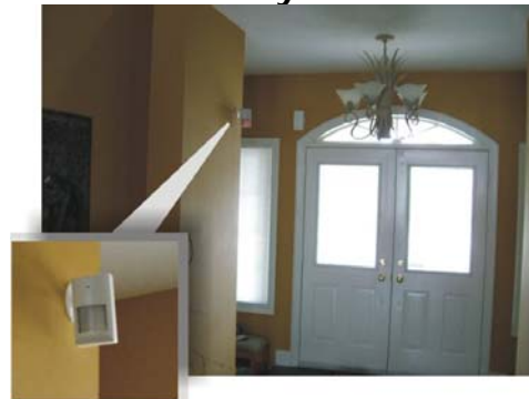
Image produced is sharp and wide angled

Position of camera is discrete and easily mounted